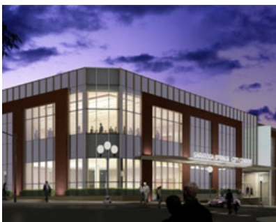
SARATOGA SPRINGS CITY CENTER

Positioned at the height of Saratoga Springs' summer social and cultural season that attracts visitors to prominent arts and entertainment events, REVEAL offers a one-of-a-kind destination for the best in modern and contemporary art. Beginning this spring, the Fair is also planning a series of innovative public programs designed for both the experienced and novice collector.